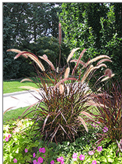
Purple Fountain Grass flowers

Purple Fountain Grass is recommended for the following landscape applications;