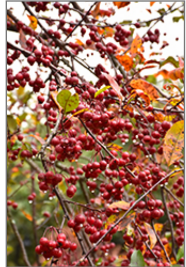
Prairifire Flowering Crab fruit

This tree should only be grown in full sunlight. It prefers to grow in average to moist conditions, and shouldn't be allowed to dry out. It is not particular as to soil type or pH. It is highly tolerant of urban pollution and will even thrive in inner city environments. This particular variety is an interspecific hybrid.