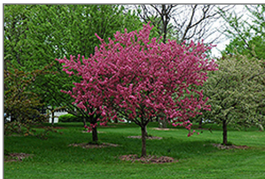
Prairifire Flowering Crab in bloom

This tree will require occasional maintenance and upkeep, and is best pruned in late winter once the threat of extreme cold has passed. It has no significant negative characteristics.