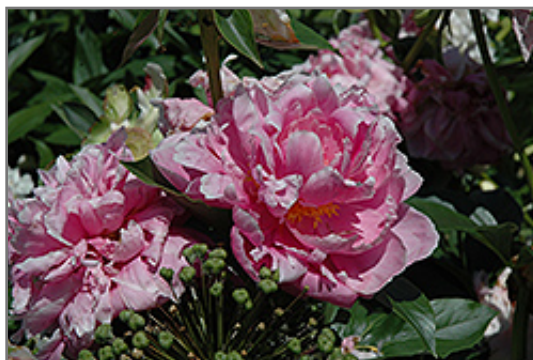
Rozella Peony flowers