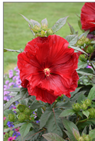
Summerific Cranberry Crush Hibiscus flowers