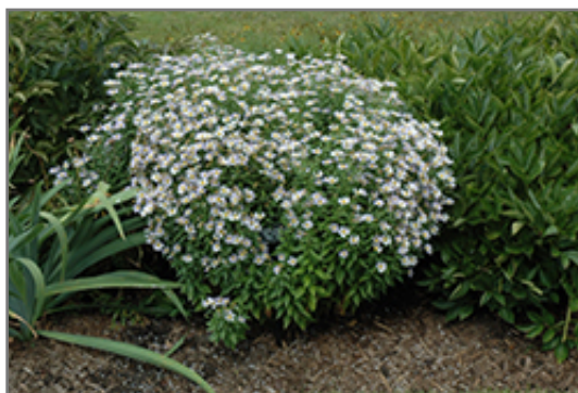
Jim Crockett Boltonia in bloom