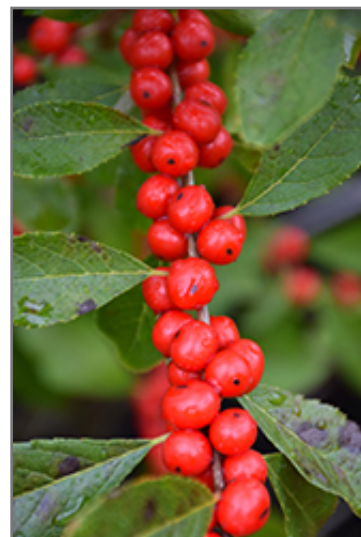
Red Sprite Winterberry fruit

Red Sprite Winterberry is recommended for the following landscape applications;