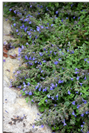
Kit Kat Catmint in bloom

Kit Kat Catmint is recommended for the following landscape applications;