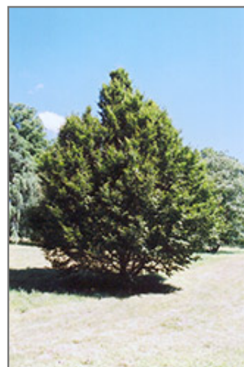
American Hornbeam

The American Hornbeam is recommended for the following landscape applications;