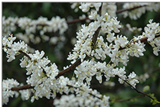
White Redbud flowers