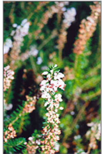
Scotch Heather flowers