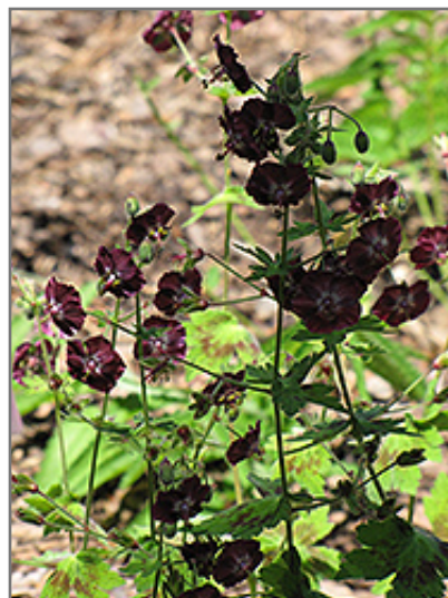
Samobor Cranesbill in bloom

Samobor Cranesbill is recommended for the following landscape applications;