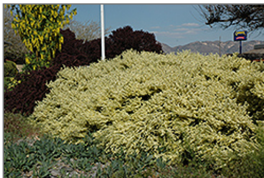
Moonlight Scotch Broom in bloom