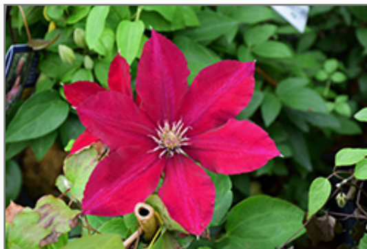
Rebecca Clematis flowers