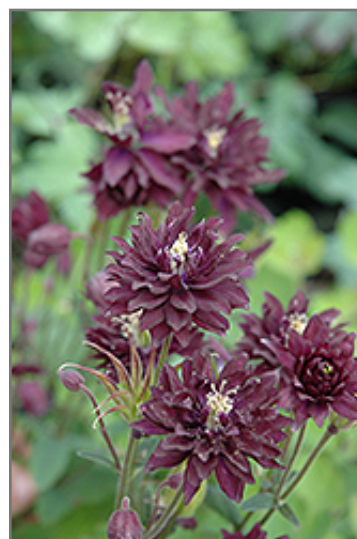
Clementine Dark Purple Columbine flowers