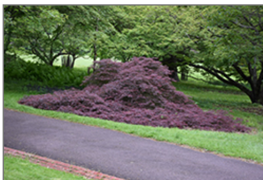
Garnet Cutleaf Japanese Maple