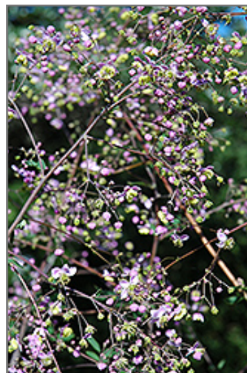
Rochebrun Meadow Rue flowers