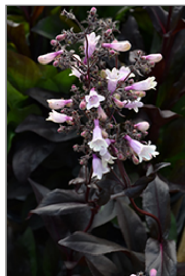
Dark Towers Beard Tongue flowers