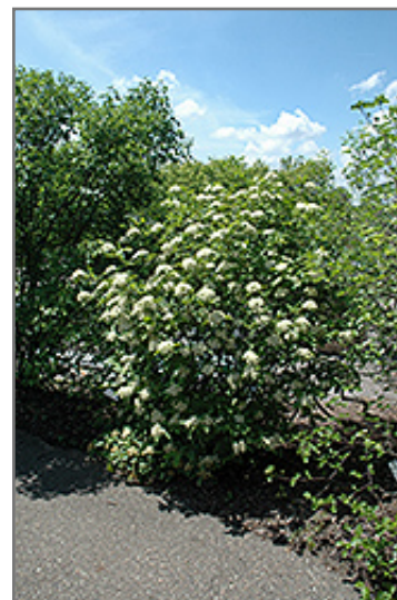
Witherod Viburnum in bloom