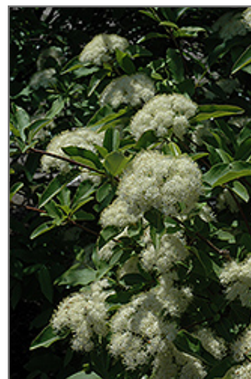
Witherod Viburnum flowers