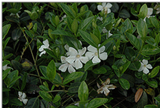
White Periwinkle flowers