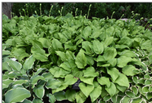
Royal Standard Hosta

Royal Standard Hosta is recommended for the following landscape applications;