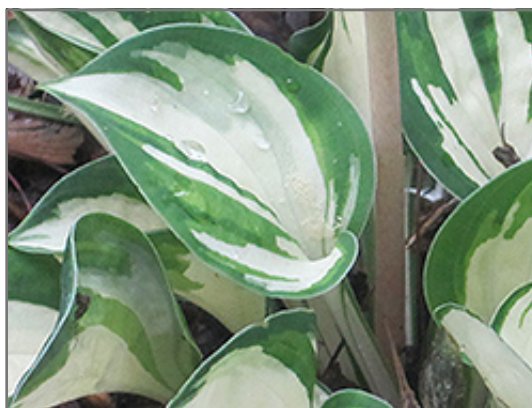
Pandora's Box Hosta foliage

Pandora's Box Hosta is recommended for the following landscape applications;