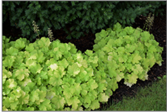
Citronelle Coral Bells in bloom

Citronelle Coral Bells will grow to be only 6 inches tall at maturity extending to 12 inches tall with the flowers, with a spread of 15 inches. When grown in masses or used as a bedding plant, individual plants should be spaced approximately 12 inches apart. Its foliage tends to remain low and dense right to the ground. It grows at a medium rate, and under ideal conditions can be expected to live for approximately 10 years. As an evergreen perennial, this plant will typically keep its form and foliage year-round.