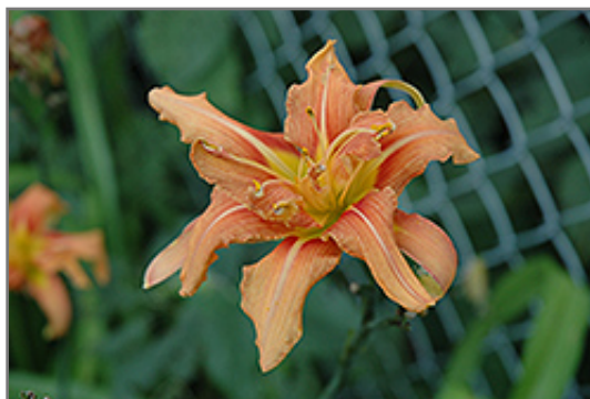
Kwanso Daylily flowers