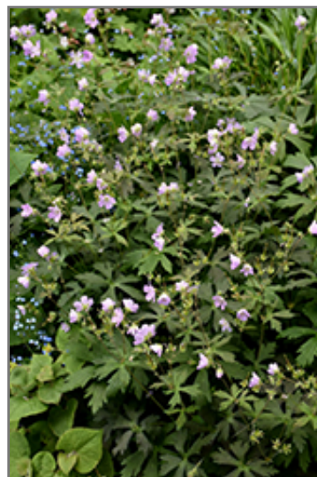
Espresso Cranesbill in bloom

Espresso Cranesbill is a fine choice for the garden, but it is also a good selection for planting in outdoor pots and containers. It is often used as a 'filler' in the 'spiller-thriller-filler' container combination, providing a mass of flowers and foliage against which the thriller plants stand out. Note that when growing plants in outdoor containers and baskets, they may require more frequent waterings than they would in the yard or garden.