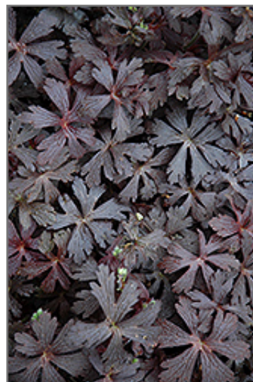
Espresso Cranesbill foliage