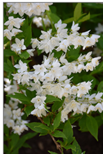
Chardonnay Pearls Deutzia flowers