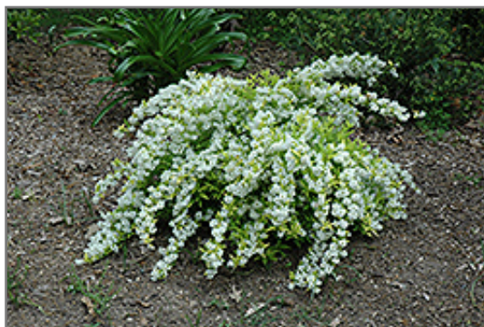
Chardonnay Pearls Deutzia in bloom

Chardonnay Pearls Deutzia is recommended for the following landscape applications;