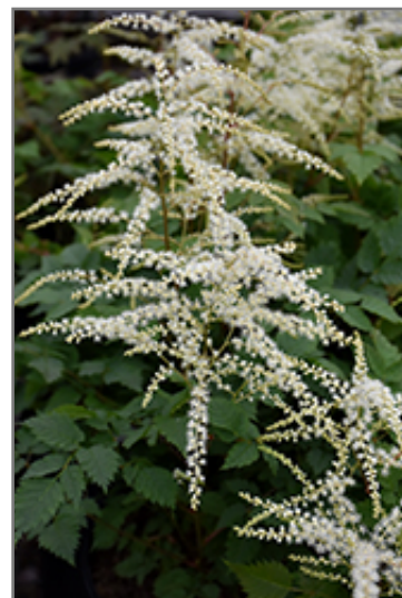
Misty Lace Goatsbeard flowers

Misty Lace Goatsbeard is recommended for the following landscape applications;