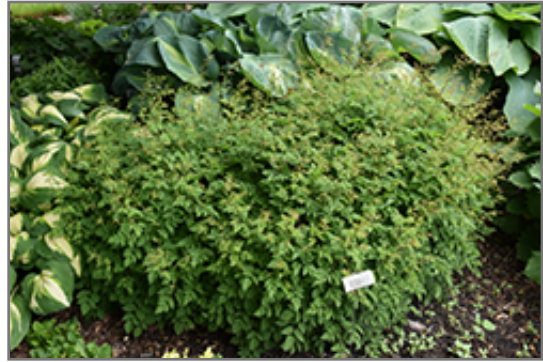
Misty Lace Goatsbeard

Misty Lace Goatsbeard will grow to be about 24 inches tall at maturity, with a spread of 24 inches. Its foliage tends to remain dense right to the ground, not requiring facer plants in front. It grows at a medium rate, and under ideal conditions can be expected to live for approximately 12 years. As an herbaceous perennial, this plant will usually die back to the crown each winter, and will regrow from the base each spring. Be careful not to disturb the crown in late winter when it may not be readily seen!