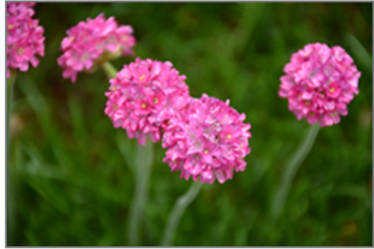
Bloodstone Sea Thrift flowers

Bloodstone Sea Thrift will grow to be only 6 inches tall at maturity extending to 10 inches tall with the flowers, with a spread of 18 inches. Its foliage tends to remain low and dense right to the ground. It grows at a slow rate, and under ideal conditions can be expected to live for approximately 10 years. As an evergreen perennial, this plant will typically keep its form and foliage year-round.