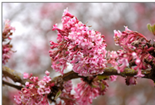
Dawn Viburnum flowers

Dawn Viburnum is recommended for the following landscape applications;