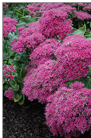
Neon Stonecrop flowers

This is a relatively low maintenance plant, and is best cleaned up in early spring before it resumes active growth for the season. It is a good choice for attracting bees and butterflies to your yard, but is not particularly attractive to deer who tend to leave it alone in favor of tastier treats. It has no significant negative characteristics.