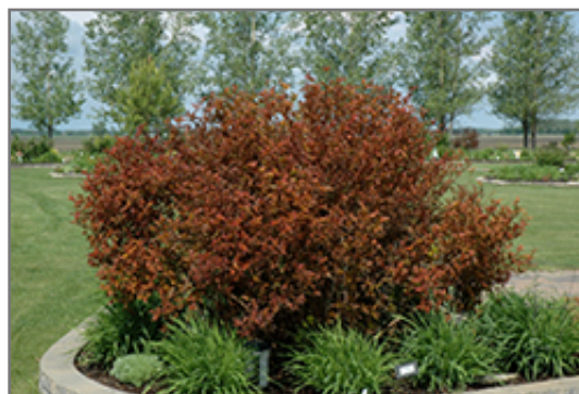
Coppertina Ninebark