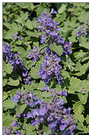
Little Titch Catmint flowers