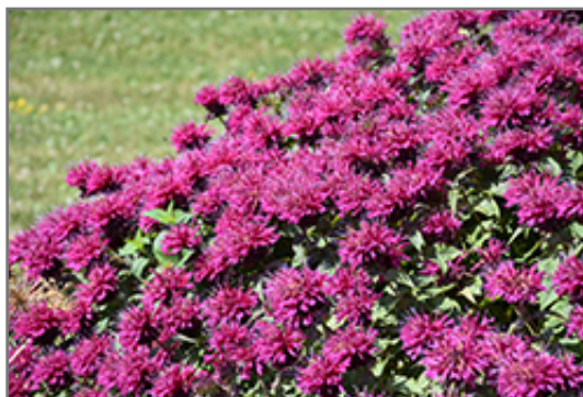
Grand Marshall Beebalm flowers

Grand Marshall Beebalm is recommended for the following landscape applications;