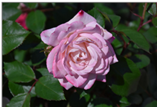
Lavender Crush&Trade; Rose flowers