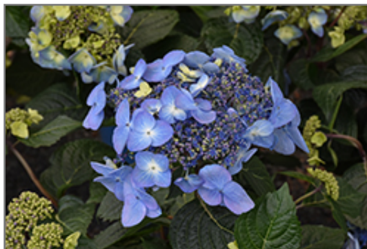
Pop Star Hydrangea flowers