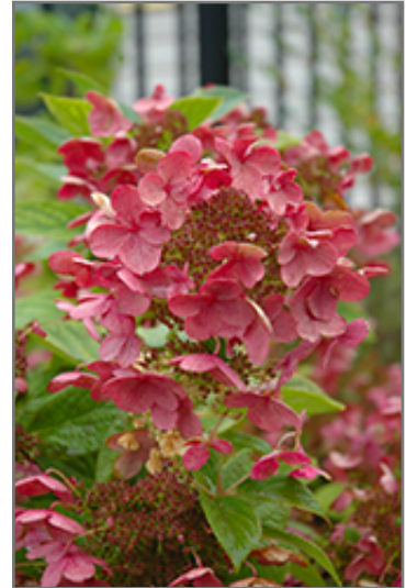
Quick Fire Hydrangea flowers (faded)

This shrub performs well in both full sun and full shade. It prefers to grow in average to moist conditions, and shouldn't be allowed to dry out. It is not particular as to soil type or pH. It is highly tolerant of urban pollution and will even thrive in inner city environments. Consider applying a thick mulch around the root zone in winter to protect it in exposed locations or colder microclimates. This is a selected variety of a species not originally from North America.