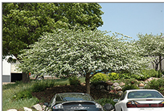
Thornless Cockspur Hawthorn in bloom