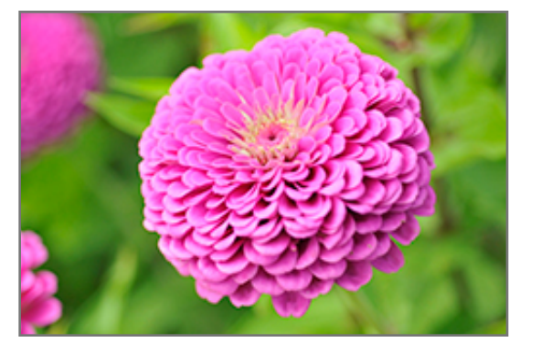
Benary's Giant Purple Zinnia flowers