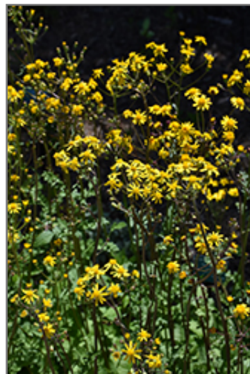
Golden Ragwort flowers