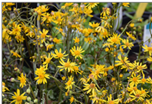
Golden Ragwort flowers