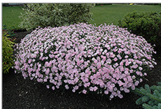
Mountain Mist Pinks in bloom