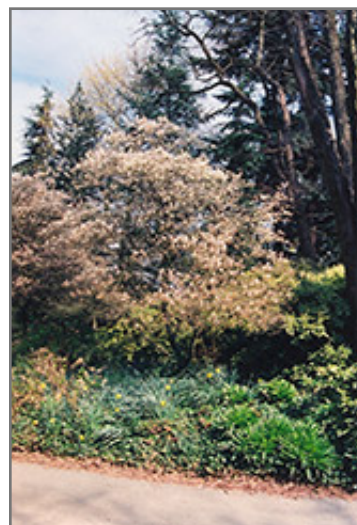
European Serviceberry in bloom