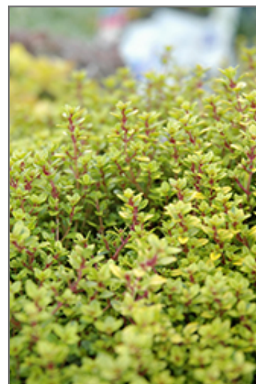
Archer's Gold Thyme flowers