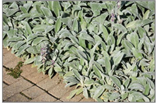
Lamb's Ears

Lamb's Ears will grow to be about 12 inches tall at maturity extending to 24 inches tall with the flowers, with a spread of 18 inches. When grown in masses or used as a bedding plant, individual plants should be spaced approximately 15 inches apart. Its foliage tends to remain dense right to the ground, not requiring facer plants in front. It grows at a fast rate, and under ideal conditions can be expected to live for approximately 10 years. As an herbaceous perennial, this plant will usually die back to the crown each winter, and will regrow from the base each spring. Be careful not to disturb the crown in late winter when it may not be readily seen!