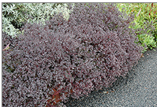
Bertram Anderson Stonecrop