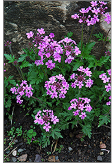
Drumstick Primrose in bloom

This plant does best in partial shade to shade. It does best in average to evenly moist conditions, but will not tolerate standing water. It is not particular as to soil type or pH. It is somewhat tolerant of urban pollution, and will benefit from being planted in a relatively sheltered location. Consider covering it with a thick layer of mulch in winter to protect it in exposed locations or colder microclimates. This species is not originally from North America.