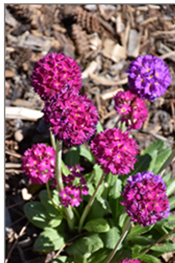
Drumstick Primrose flowers