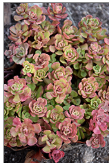
Pink Form Southern Stonecrop