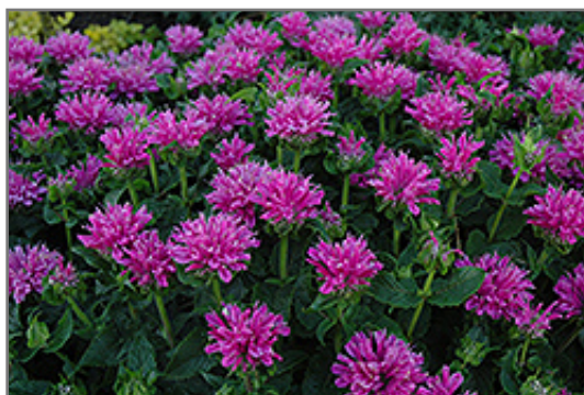
Petite Delight Beebalm flowers