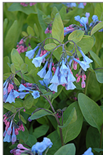
Virginia Bluebells flowers