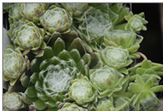
Cobweb Buttons Hens And Chicks