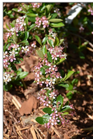
Ground Hug Aronia flowers