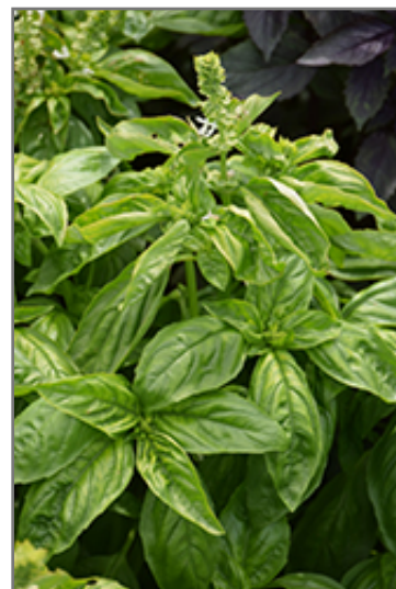
Genovese Basil foliage

Genovese Basil will grow to be about 20 inches tall at maturity, with a spread of 14 inches. When grown in masses or used as a bedding plant, individual plants should be spaced approximately 12 inches apart. This fast-growing annual will normally live for one full growing season, needing replacement the following year.